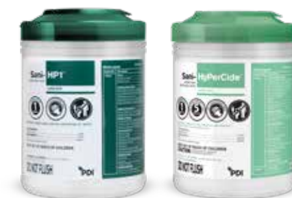
Kills C. diff .