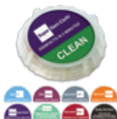
Sani-Cloth® Slider Compliance Indicator adheres to equipment/surfaces to indicate as clean vs. dirty