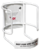
Sani-Bracket® for wall/pole mounting of a Sani-Cloth® Canister

Support compliance and streamline disinfection by making the right products easy to access, identify, and track—exactly where they're needed most.