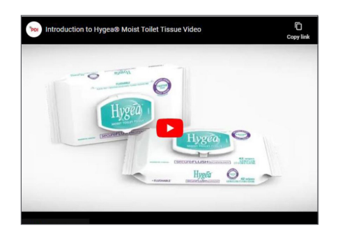
Introduction to Hygea® Moist Toilet Tissue Video