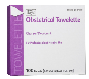
Reorder # D74800