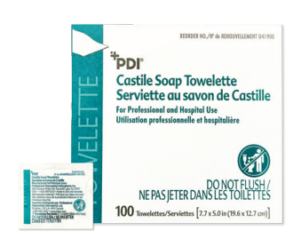
Reorder # D41900