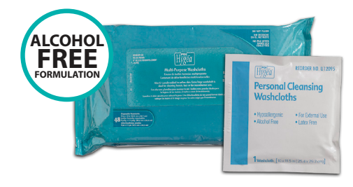
Softpack Reorder # J22750 Packet Reorder # U12095