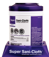
Sani-Canister Caddy® for placement on flat surfaces (Bilingual)