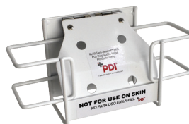
Wire Softpack Bracket allows for convenient access