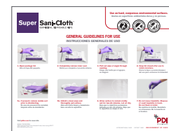
Educational Wall Charts and Signage (Bilingual)