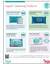
Hygea® Sell Sheet