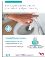
Moist Toilet Tissue Sell Sheet