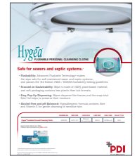
Flushable Personal Cleansing Cloth Sell Sheet