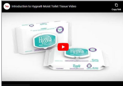
Introduction to Hygea® Moist Toilet Tissue Video