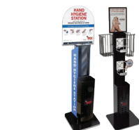
Floor Stands for placement in high traffic areas to provide convenient access