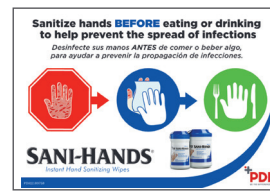
Educational Materials, Wall Charts and Signage (Bilingual)