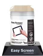
Sani-Canister Caddy® for placement on flat surfaces (Bilingual)