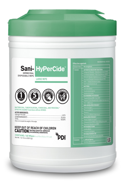
EPA Reg. No. 9480-16