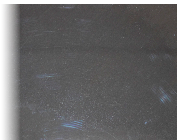
Sani-HyPerCide (Clear Polycarbonate)

Sani-HyPerCide disinfectant also shows improved aesthetics over Clorox ® Bleach, leaving behind less residue so there's no need for a secondary cleaning step.