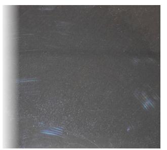
Sani-HyPerCide (Clear Polycarbonate)