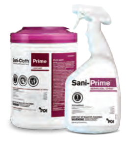
Powered by a next generation formulation, protect your patients, staff, and facility from HAIs in just 1 minute.