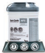
Sani-Canister Caddy ® for placement on flat surfaces (bilingual)