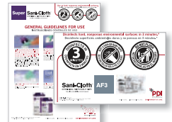
Educational Wall Charts and signage (bilingual)