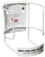
Sani-Bracket® for wall/pole mounting of a Sani-Cloth® Canister