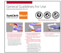
Educational Wall Charts and Signage (Bilingual)