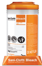
Sani-Canister Caddy® for placement on flat surfaces (Bilingual)