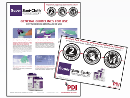
Educational Wall Charts and Signage (Bilingual)

REORDER NO. WIPE SIZE CASE PACK CASE WGT CASE CUBE PALLET TI/HI