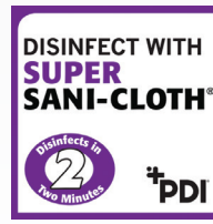
Sani-TAG® Equipment ID System to identify what surface disinfectant should be used on a particular item