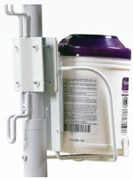
PDI® 3-in-1 Universal Sani-Bracket® for wall/pole mounting of a Sani-Cloth® Canister