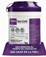
Sani-Canister Caddy® for placement on flat surfaces (Bilingual)