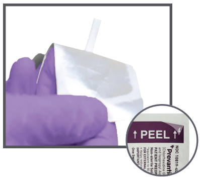
Item No. S40750 Peel Apart