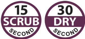
Prevantics Skin Swab