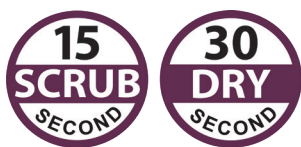
Prevantics Skin Swab