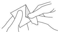
Tear down diagonally.