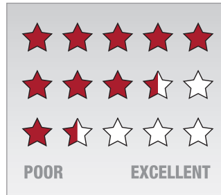
Lower Patient Satisfaction