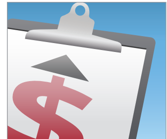
Increased Cost Burden