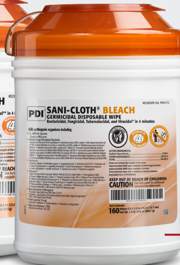
Clinical Size Wipes for small high-touch surfaces and equipment shared between patients