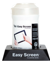
Sani-Canister Caddy® for placement on flat surfaces (Bilingual)