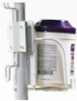
PDI® 3-in-1 Universal Sani-Bracket® for wall/pole mounting of a Sani-Cloth® Canister