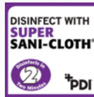
Sani-TAG® Equipment ID System to identify what surface disinfectant should be used on a particular item