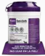
Sani-Canister Caddy® for placement on flat surfaces (Bilingual)